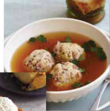
Canederli in Brodo