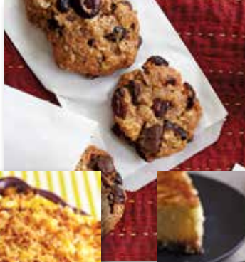
Gluten-Free Chocolate–Coconut–Cranberry Cookies