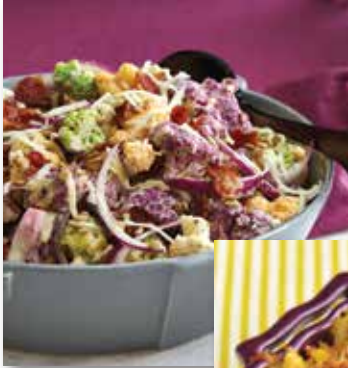
Sweet 'n' Sunny Cauliflower Salad